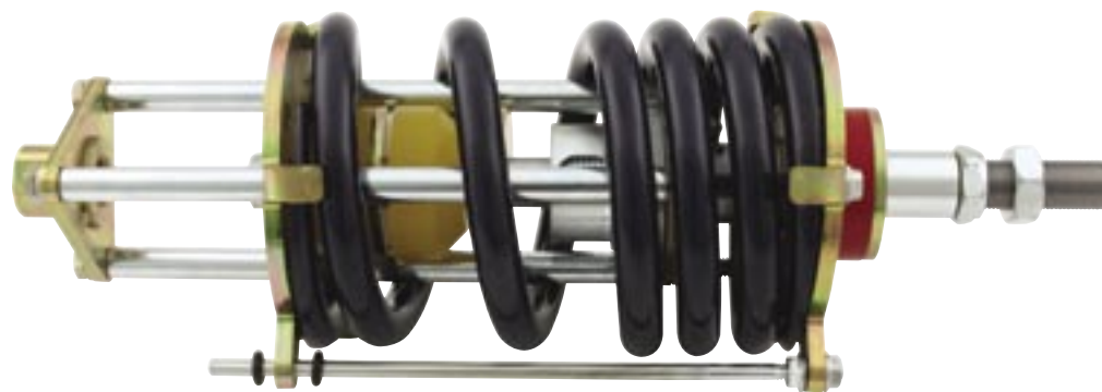
Shown Assembled With Spring - Spring Not Included

Allstar Performance 8300 Lane Dr., Watervliet, MI 49098 Phone: (269) 463-8000 Fax: (800) 772-2618 www.allstarperformance.com